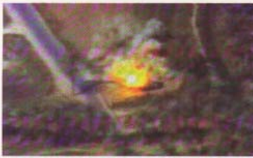
An Iraqi truck-mounted missile, believed to be an S-A3, is launched at a coalition aircraft in July 2001.