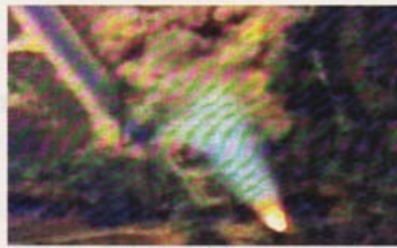
An Iraqi missile heads in the direction of a coalition aircraft in July 2001.